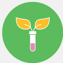
Biology AQA (Exam Pack available)