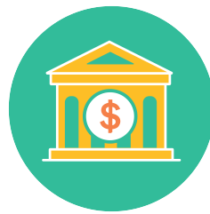
Economics AQA, EDEXCEL

To find out more about the platform or register your interest, visit uplearn.co.uk/teachers