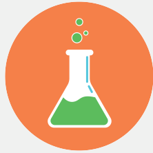
Chemistry AQA, OCR

There is a further £200 of funding available per student taking subjects associated with higher future wages and a more productive economy, including: