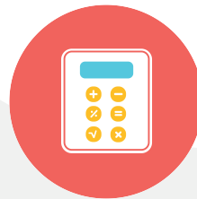
Maths AQA, OCR EDEXCEL, CIE